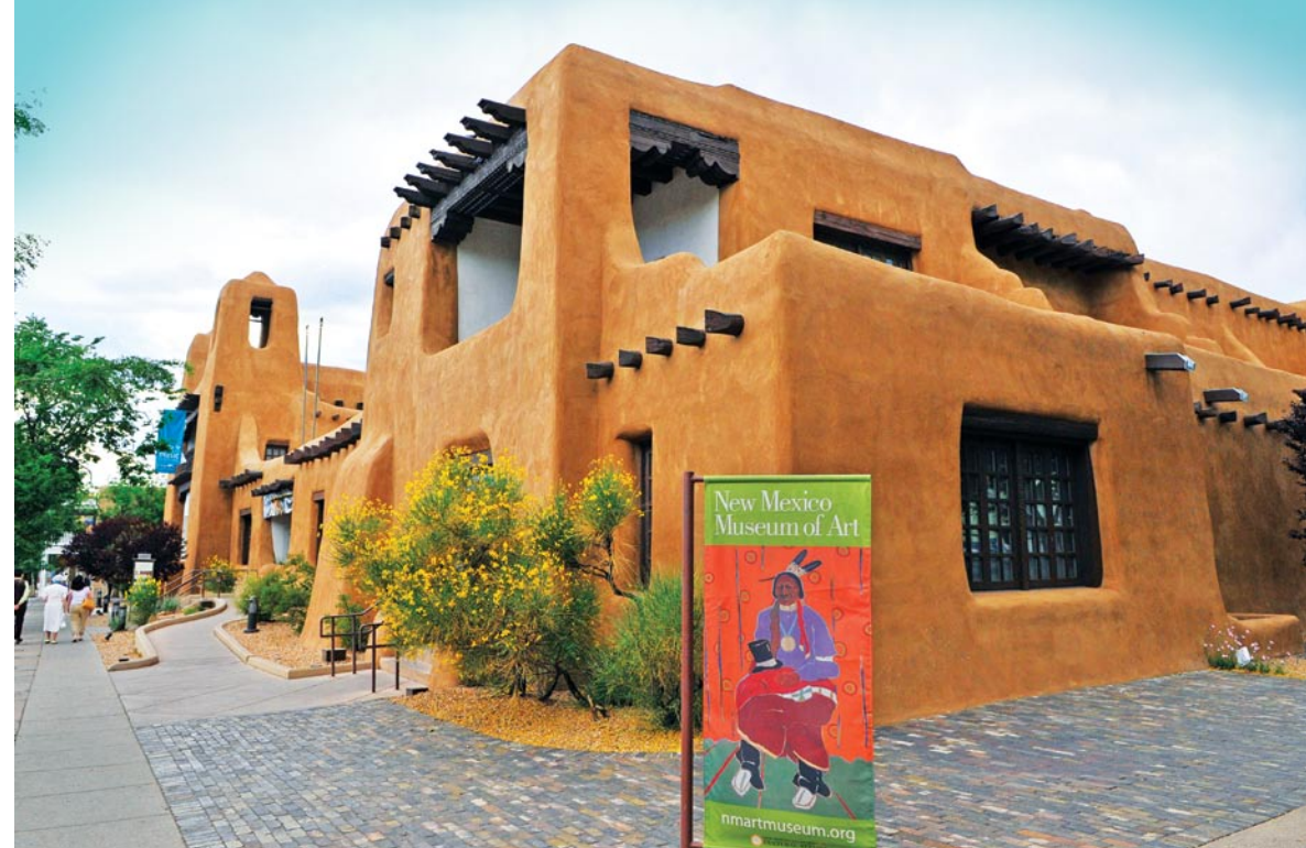
New Mexico Museum of Art, top; vendors' wares (below) in downtown Santa Fe.