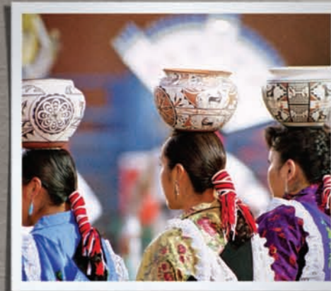
At the Indian Pueblo Cultural Center, Native American traditions are alive and well today.

ONCE YOU SET FOOT IN ALBUQUERQUE, THE FIRST THING YOU CAN'T HELP BUT NOTICE IS OUR MOUNTAIN. Its towering presence becomes the focus of your every stray glance. Even those of us who see it every day regularly stare in amazement. And never is this attention rewarded more than at sunset. As daylight fades, the setting sun paints the mountain in a mixture of pinks, crimsons, and magentas, making it clear why the Sandias (Spanish for watermelon) are so aptly named. And just when you acclimate to their stunning appearance, the now-dormant volcanoes that