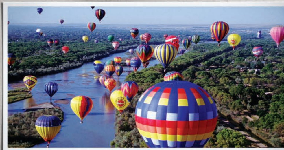
Held every Fall, the Albuquerque International Balloon Fiesta (Oct. 6-15) is the largest event of its kind in the world.

line our city's western border and the endless mountain ranges that seem to adorn every horizon take your breath away all over again. But that's just the beginning of the surprises Albuquerque has in store.